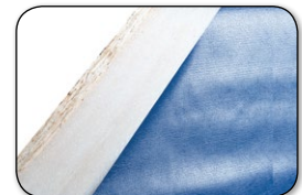
2" Laminate Wall Pads