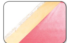
2" 100 ILD Polyurethane Wall Pads